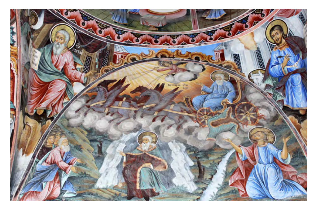
Figure 5: The Holy Prophet Elijah in his fiery chariot ascending to heaven. Fresco from the open gallery of the Rila Monastery, South-Western Bulgaria (1847).

As noted by Viktor Zhivov,<sup>113</sup> this kind of practices reflect the existence of a certain "Russian jurisprudential dualism" [ pyccĸuŭ юридический дуализм ], which may be regarded as a civic counterpart to religious and cultural dualism. In this kind of context, law courts in general may be perceived as personifications of demonic powers. Thus, in juridical vernacular incantations, magistrates appear to be symbolically equated with diseases or evil spirits;<sup>114</sup> accordingly, the antidote against them is similar to that used in healing spells. According to Zhivov, the folklore "incantations protecting against judges" [ заговоры про- mus судей ]<sup>115</sup> indicate that in medieval Russia, the very procedures of the law court were "perceived as demonic activity" [ cyd рассматривается как бесовское действо ]. Unsurprisingly, the absolute lawful protector on which the defendant could rely upon was believed to be the righteous King Solomon, who can occasionally be replaced by the Biblical Patriarch and trickster, Jacob.