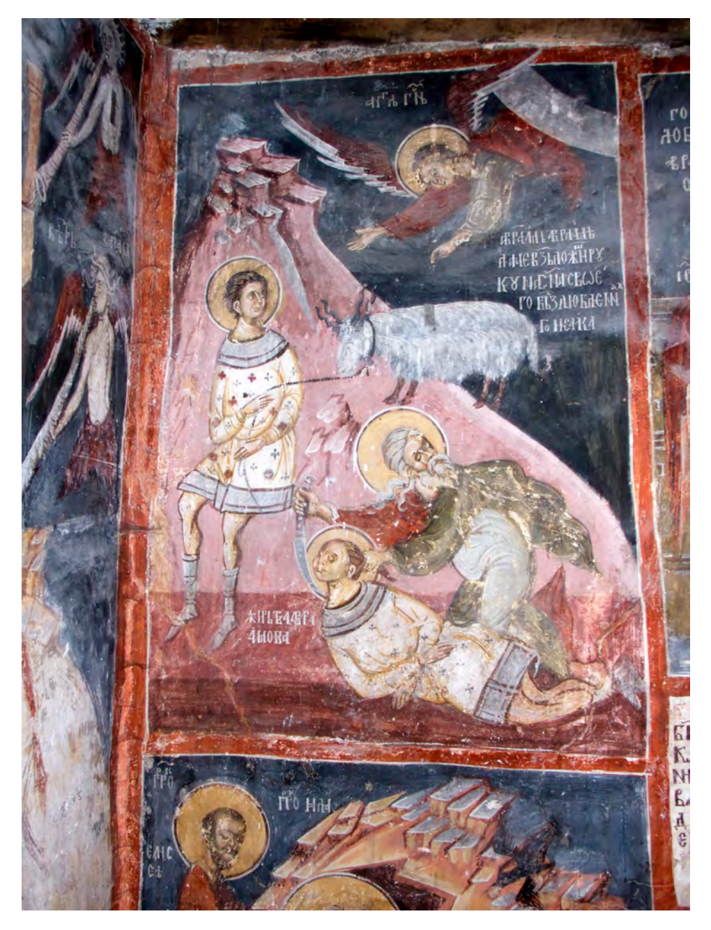
Figure 1: Abraham's sacrifice. Fresco from the Dragalevtsy Monastery of the Dormition of the Mother of God, Bulgaria (1476).