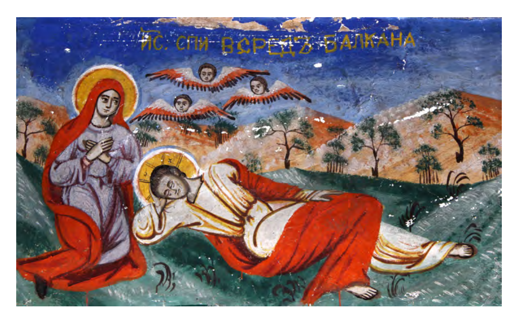
Figure 6: Jesus asleep in the Balkan Mountains. Fresco from the Church of The Holy Prophet Elijah in the village of Bogoroditsa, South-Western Bulgaria (1884).

features of local traditions; thus most of the Old and New Testament characters—from the ploughing Adam and spinning Eve, to the shepherds venerating the Infant Jesus, and the lamenting women next to the Crucifixion—are dressed as local peasants. Furthermore, Jesus is often depicted against the habitual landscape, with neighboring valleys and mountains in the background, familiar to both the indigenous icon-painters and storytellers. In fact, in many remote villages of Bulgaria, local Christians could see one typical scene in the frescoes of their small churches—"Jesus sleeping in the Balkans" [ Ucyc cnu на Балкана ] (see Figure 6). Indeed, "our" birthplace becomes the homeland of God, born among us, as one of us. What other language could He possibly speak if not "ours"?