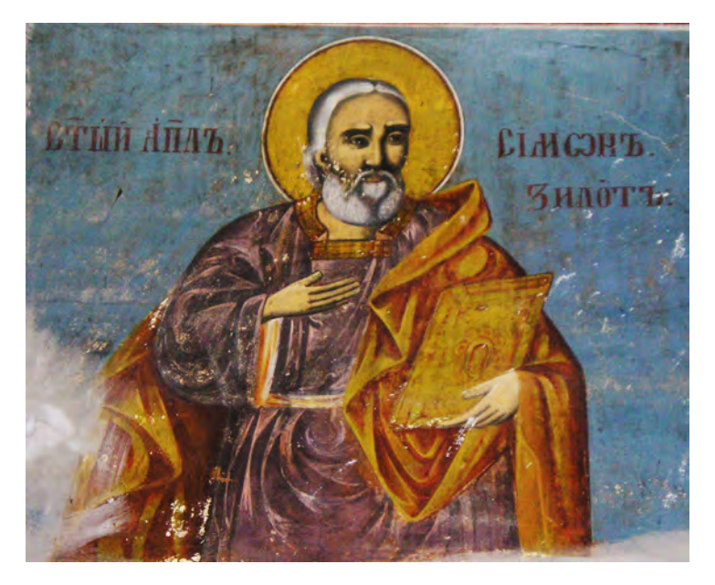
Figure 8: Simon the Zealot (Zelotes). Fresco from the Church of St. George in the city of Kyustendil, South-Western Bulgaria (1878–1882).

Когда идешь траву рвать, нужно сделать шесть поклонов дома и шесть при самой траве.<sup>133</sup>