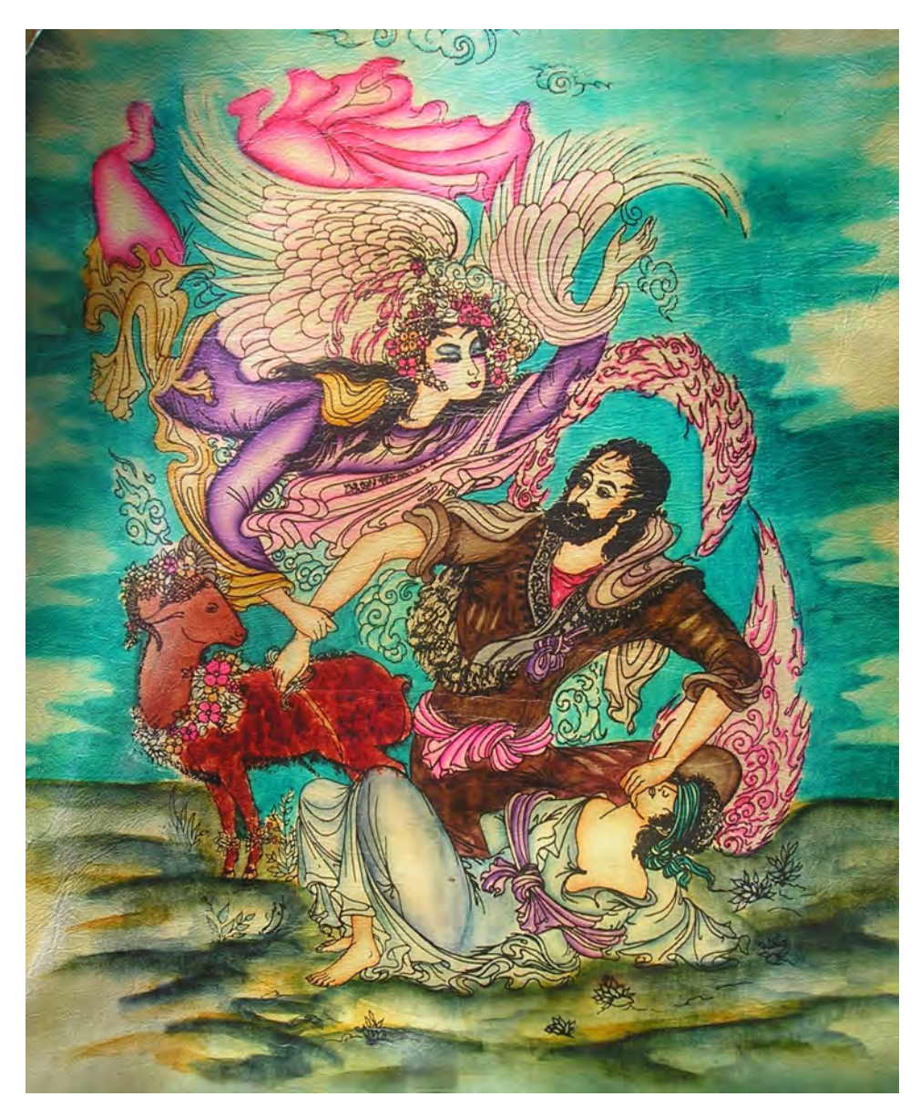
Figure 3: Ibrahim's Sacrifice. Persian, provenance unknown.

5. What Language Does God Speak? (F. Badalanova Geller)