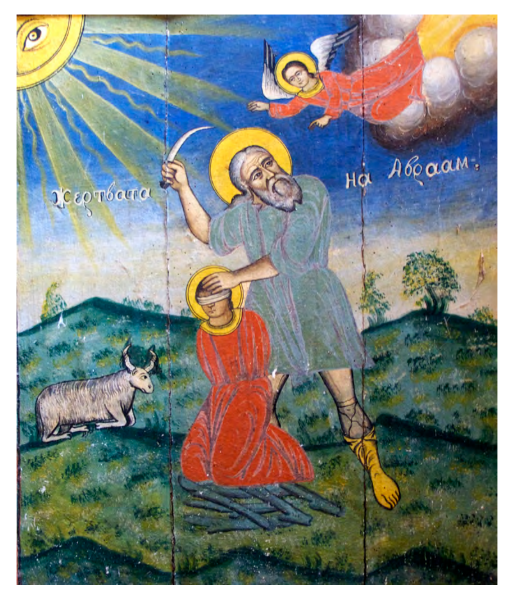
Figure 2: Abraham's sacrifice. Painted panel of the iconostasis of the Church of Saint Athanasius in the Village of Gorna Ribnitsa, South-Western Bulgaria (1860).