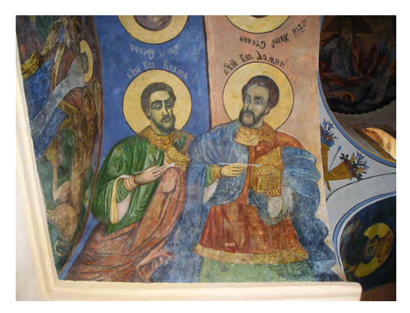
Figure 7: The twin brother-physician-saints Cosmas and Damian. Fresco from the Church of St. George in the city of Kyustendil, South-Western Bulgaria (1878–1882).

И отвещает мертвое тело Адамово: "Я не слышу звона колокольнева, пенья церковнаго, в белом теле ходячей грыжи, тильной, жильной, пуповой, суставной, становой, подкожной, ушной, глазной, зубной." Так же раб Божий (имя рек) не слышал бы в себе в белом теле ходячей грыжи, отныне и до века, век по веку веков. Аминь.<sup>127</sup>